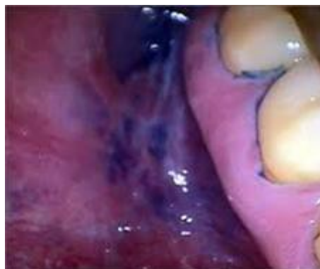
An example of stained tissues.